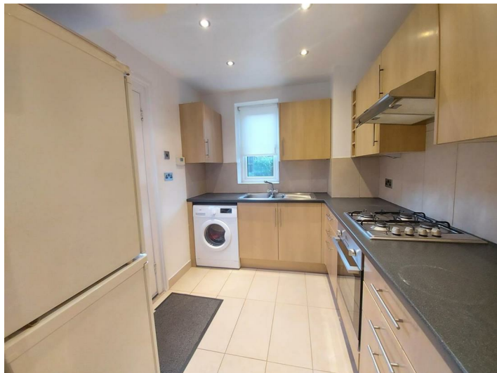
Kitchen 13'1" x 7'3" (4.01 x 2.22)

Range of Wall and Base Units with side door access to the garden