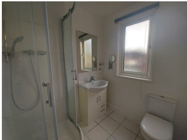
Shower Room 6'9" x 6'4" (2.06 x 1.95)

Corner Shower with separate sink and w/c