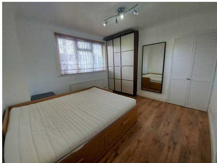
Bedroom 2 14'4" x 11'7" (4.39 x 3.54)

Large king size bedroom with ample storage and laminate flooring