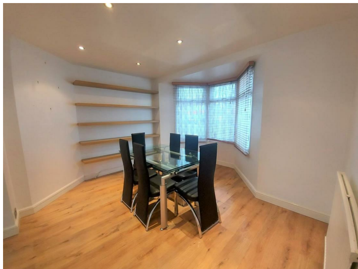
Dining Room 13'9" x 12'9" (4.21 x 3.89)

Front Facing room with dining table and chairs with wood effect flooring